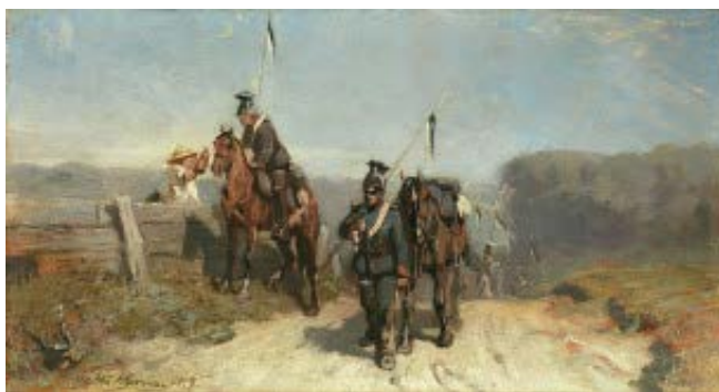
Hans von Marées, Ulanen auf dem Marsch, 1859 Öl auf Holz, 19 x 35,4 cm

The Bayerische Staatsgemäldesammlungen have accepted the recommendation in full, and restituted the work to the Max Stern Estate on 9 May 2022, under the provisos stipulated by the Commission.