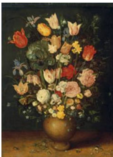
Workshop of Jan Brueghel the Elder Bouquet of Flowers in a Clay Vase, early 17th century, 70 x 52 cm, oil on oak