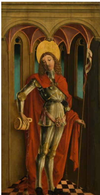
Bavarian, St. Florian, c. 1480 Conifer wood 125.3 x 65.2 cm