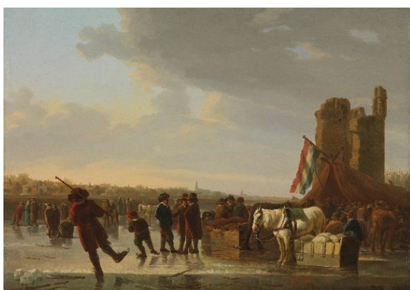
Copy after Albert Cuyp, On the Ice, 18th/19th century, Oil on canvas, 66.8 x 42.3 cm

Bavarian State Minister of the Arts Bernd Sibler returns together with the Bavarian State Painting Collections, the Bavarian National Museum and the State Collections of Prints and Drawings, Munich, works of art, which were confiscated by the Gestapo, to the community of heirs from Europe, Asia and Africa.